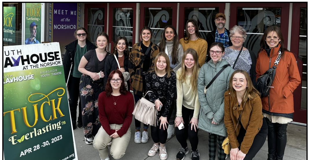
At the theatre to see Tuck Everlasting