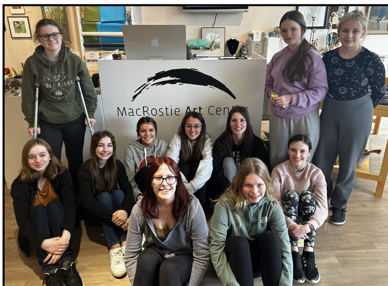
MacRostie Art Center Grand Rapids, MN