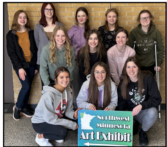
Northwest Art Council Annual Spring Show