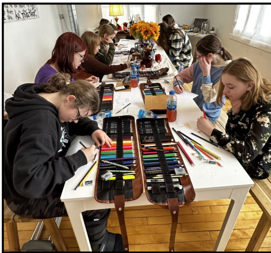
Abstract workshop activity