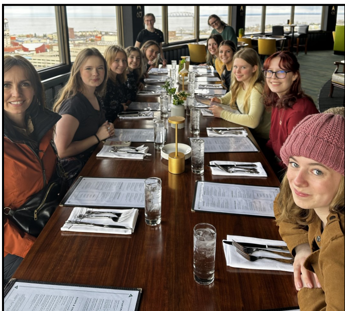
Dinner at the Apostle restaurant