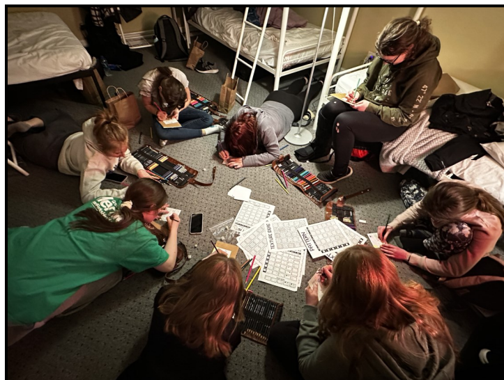
Abstract art activity to prepare for Saturday's workshop