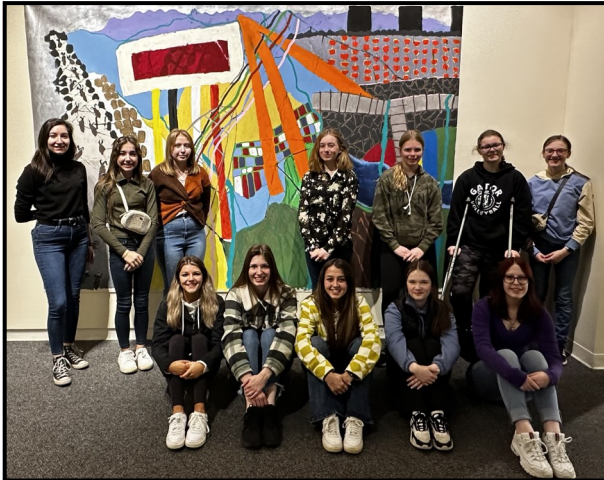
Duluth Art Institute